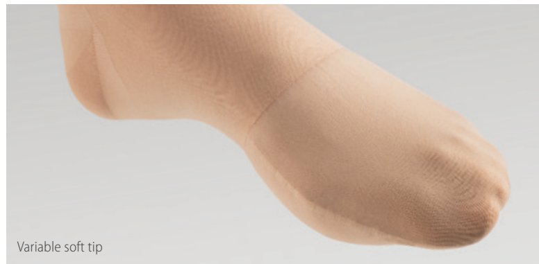
Variable soft tip