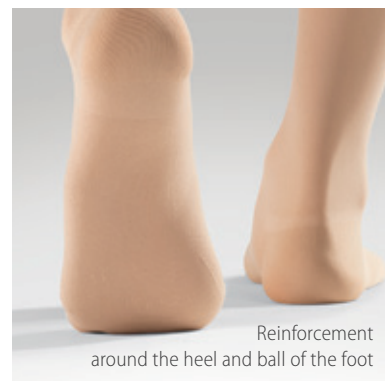
Reinforcement around the heel and ball of the foot