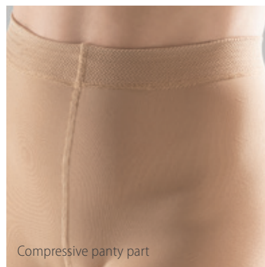
Compressive panty part